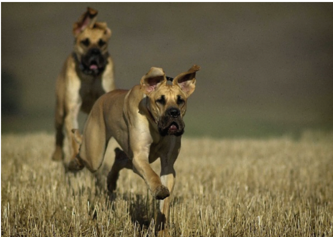
Photo 1 – Champion Myhalston Mr Malachi and his sister Champion Myhalston Miss Kiara (11 month old)