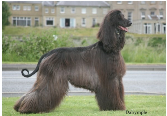
Photo 2 – Rashid Ebn Hugo Von Haussman before eating Canine Dermatitis DRM