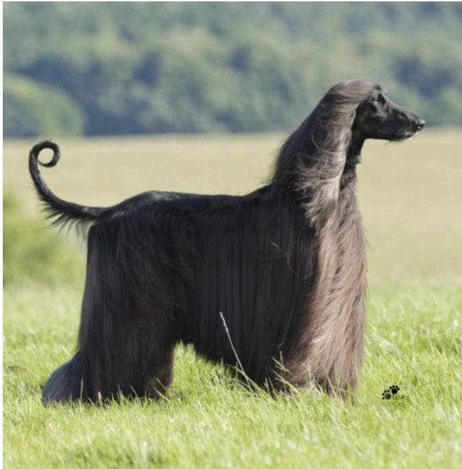
Photo 3 - Rashid Ebn Hugo Von Haussman at Myhalston after eating Canine Dermatitis DRM

Also not only did the diet help his coat, but his muscle condition too. Rashid is shown all over Europe and has to be in excellent body condition (Photo 3 & 4).